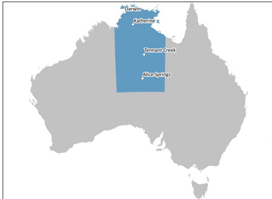
Fig. 1 Map of the Northern Territory

prove unmanageable to describe in a digestible way. We posit that there is value in a focused examination of legislated policies, to allow for greater depth and consideration. For the purpose of this paper we have considered both legislation; that is the law itself as an Act passed through Parliament, which can only be amended through another Act of Parliament; and regulations, which are the guidelines that dictate how provisions of an Act are applied [15]. We hope this paper will provide a reference point for those examining alcohol policy in the NT, allowing them to understand what has been done previously and located relevant evidence related to the policies of interest.