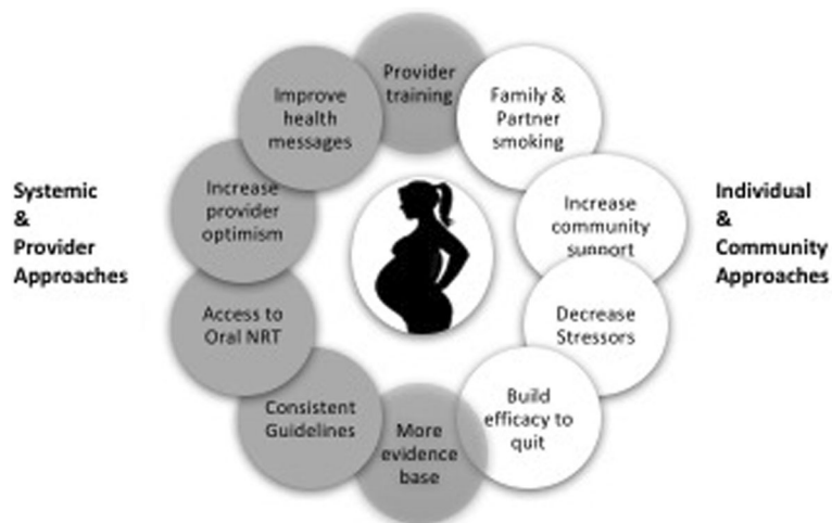
Fig. 3 Approaches to improve smoking cessation among pregnant Indigenous women

In specifying the target behaviour, the BCW guidebook recommends consideration of Who, What, When, Where, How often and with Whom. The target behaviour therefore would be for clinicians (Who) in the ACCHS (Where) to proactively offer assistance to every pregnant Indigenous smoker (Whom) to quit smoking (What), initially by counselling, but importantly by offering NRT, if the woman was not able to achieve