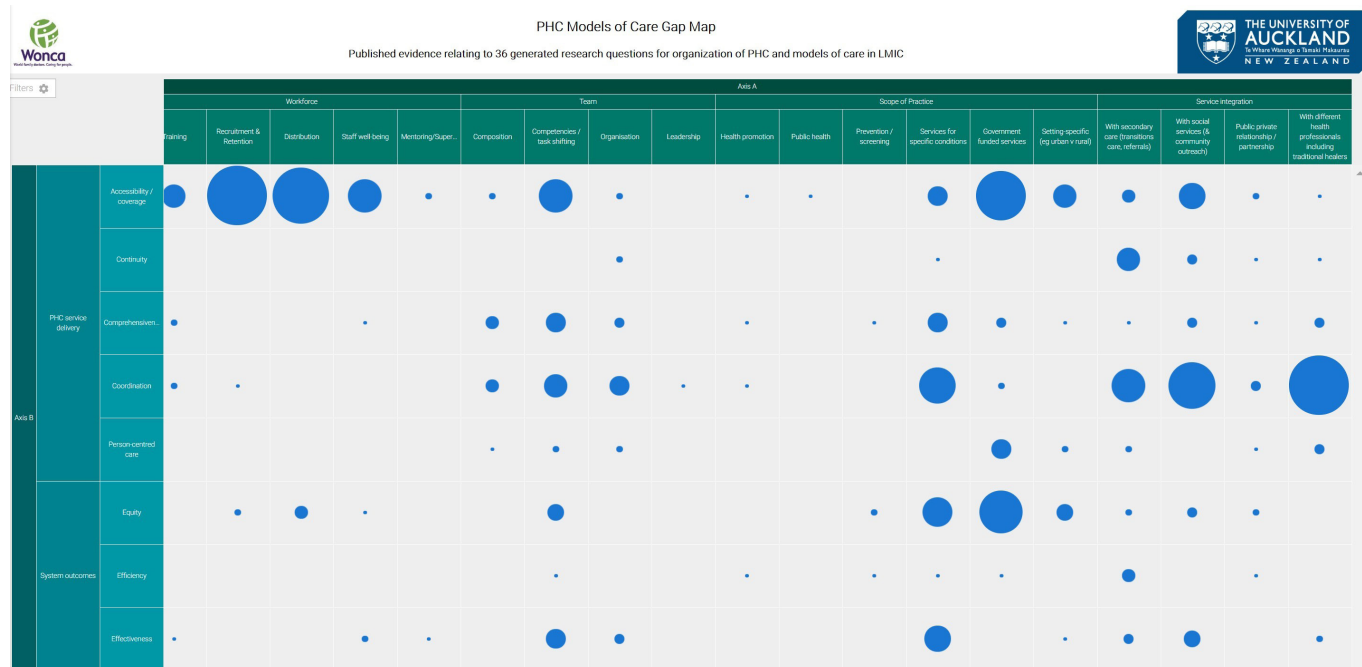
Figure 3 Static version of gap map of studies for model of care.

question were coded for two axes. Seven global regions (Europe, Eastern Mediterranean, Asia Pacific, South Asia, Africa, North America, South America) and a list of all LMICs were included as filters for the map.