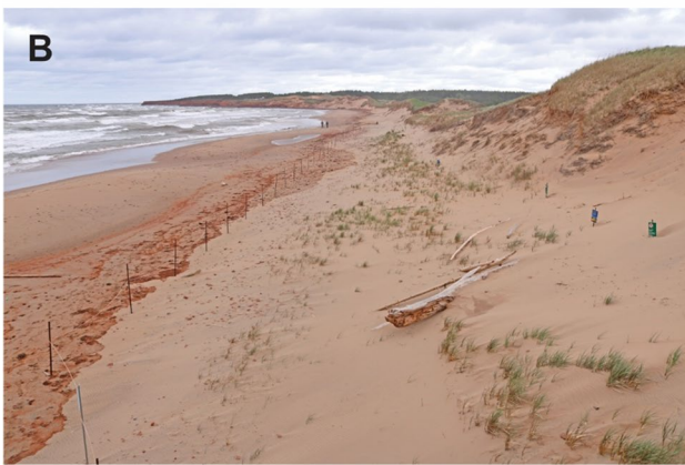
Fig. 9 Examples of beach and dune management at Cavendish Beach: A) View looking east of the main beach at Cavendish in June 2016, two years after restoration began on a large blowout resulting from trampling next to the boardwalk access point. Repurposed Christmas trees are used as a substitute for sand fences to trap sand, and marram grass is planted in the area between the trees. Fencing was used to keep visitors off the regeneration area; B) View looking east of the beach in May 2022 showing the restored foredune on the right and virtual fencing along the high tide line to keep visitors away from the vegetation forming embryo dunes along the base of the stoss slope of the foredune. Signage, visible to the right of the buried tree trunk on the stoss slope, is used to inform visitors of the need to keep off the foredune

Open Access This article is licensed under a Creative Commons Attribution 4.0 International License, which permits use, sharing, adaptation, distribution and reproduction in any medium or format, as long as you give appropriate credit to the original author(s) and the source, provide a link to the Creative Commons licence, and indicate if changes were made. The images or other third party material in this article are included in the article's Creative Commons licence, unless indicated otherwise in a credit line to the material. If material is not included in the article's Creative Commons licence and your intended use is not permitted by statutory regulation or exceeds the permitted use, you will need to obtain permission directly from the copyright holder. To view a copy of this licence, visit http://creativecommons.org/licenses/by/4.0/ .