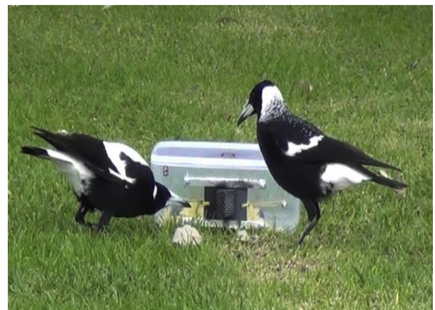
Figure 1. Novel foraging task. Food rewards could be extracted by pushing the self-shutting sliding door either left or right.